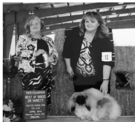
CH Déjà vu Sir Gold for Pekehuis x CH Pleiku Kerimere A Dream is a Wish