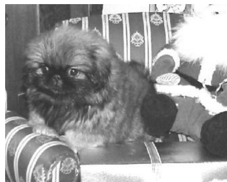
Travis at about 10 weeks old.