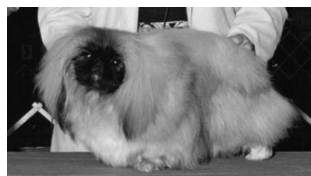
Gina at about 8 months old.