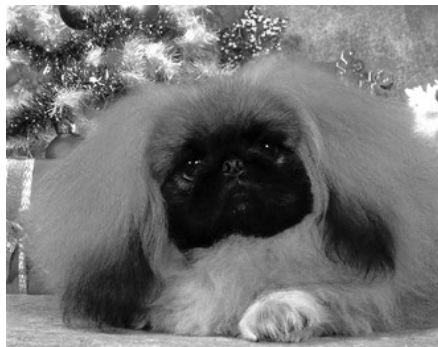
Taken at 7 months old.