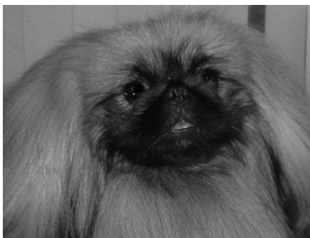
Niles, casual adult head shot.