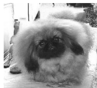
CH Akarana Excalibur x Déjà vu Niagara Falls Honeymoon (both Rover children).