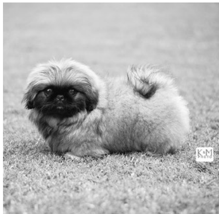
GCH Briar-Mar American Gigolo x Akarana Allure (Bradley daughter) Left: Stanley, Déjà vu Stand By Me. Right: Faith, Déjà vu Keepin' the Faith.