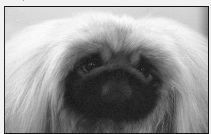
CH Dèjá vu It Had to Bee You "BIJOU", photo by Pam Guevarra