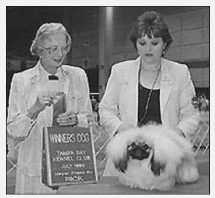
CH Dèjá vu lt had To Bee You "BIJOU" as a puppy