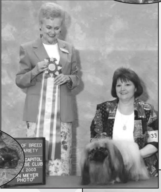
BISS CH Dèjá vu Travelin' Man

BISS CH Deja vu Travelin' Man x CH Pekehuis Dream of Gold 2004 litter