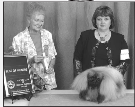
CH Deja vu Pekehuis Gold Fusion, 12 months old