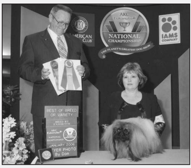
CH Dèjá vu Pekehuis Gold Fusion "BRADLEY" Best of breed Eukanuba 2006

This is a photo of my mother with her mother's Pekingese Footsie. Footsie is the dog that started the Pekingese love affair for me.