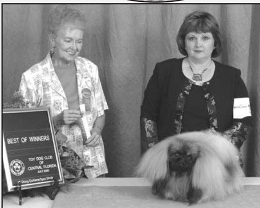
CH Deja vu Pekehuis Gold Fusion, 12 months old

BISS CH Dèjà vu Travelin' Man Dèjà vu Pekehuis Still Gold, (JIMMY JAMES) owned by Pamela Vanderpool, litter mate to CH Dèjà vu Pekehuis Gold Fusion