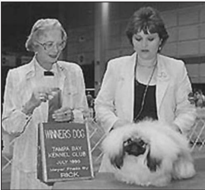
CH Dèjà vu It had To Bee You "BIJOU" as a puppy