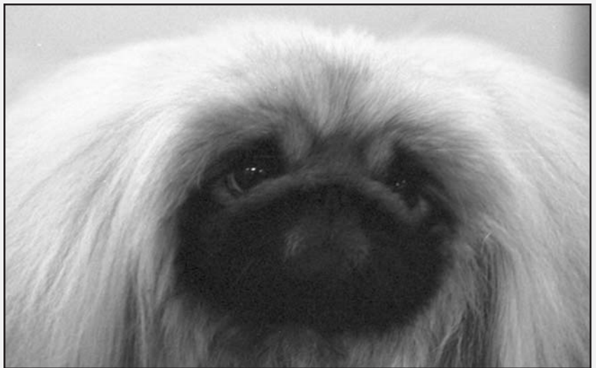
CH Dèjà vu It Had to Bee You "BIJOU"