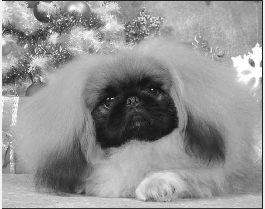
CH Dèjà vu Sir Gold for Pekehuis "NILES" at 7 months old.