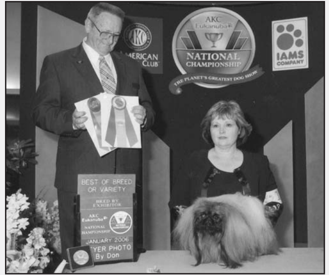
CH Dèjà vu Pekehuis Gold Fusion "BRADLEY" Best of breed Eukanuba 2006

To tell the truth, I still look for her every night at bed time.