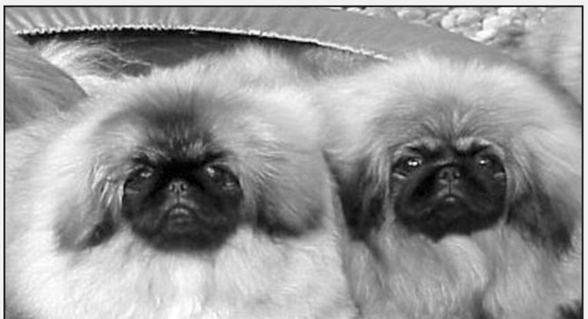
Dèjà vu Pekehuis Gold Absolut and Deja vu Only Gold Will Do Half sisters, Travis daughters to be in the ring later this year.