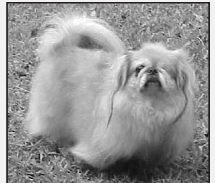
Bug-Marie Shephard lived until nearly 18 years old, died in 2003.

Family Affair CH Dèjà vu Sir Gold for Pekehuis (NILES) with the repeat breeding that produced CH Dèjà vu Pekehuis Gold Fusion, Still Gold and Gold Absolut.