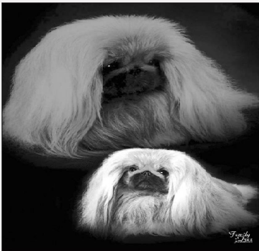
CH Tradewinds Let It Bee Me for Dèjà vu, "HATEFUL", a Bijou daughter