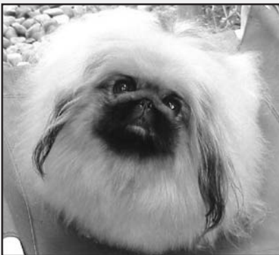
West Bay's Dèjà vu Boo at about 8 years old. Boo is the great-grandmother to most of the current Dèjà vu dogs.

BISS CH Deja vu Travelin' Man x CH Pekehuis Dream of Gold 2004 litter